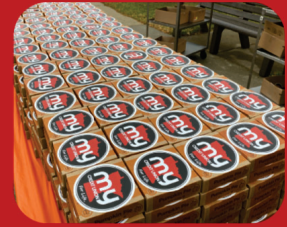
500 Pies ready to go!