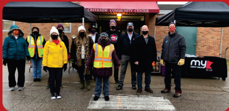
Group photo of the MY Credit Union staff, Board members and other city representatives who volunteered at the drive by pie event.