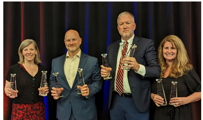
MY CREDIT UNION was honored to earn nine Diamond Awards on March 28 as voted on by credit union peers from around the country for supporting Minnesota veterans by starting the "Fall Classic" Charity Cornhole Tournament. The 2023 event will be Tuesday, September 19!