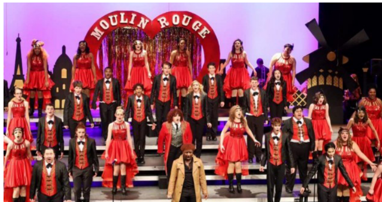
Congratulations, Kennedy Show Choir, on making it to Nationals!